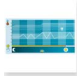
Saver cycle (3)