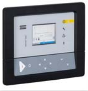
Graphs on the screen (1)