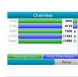
Graphic serverplan indicator (5)