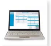
Free online website (6)