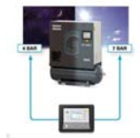
Dual setpoint (4)